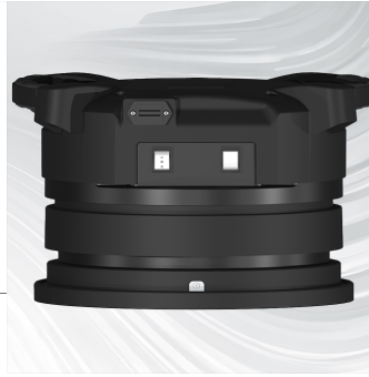
NEW HEAD New and improved head