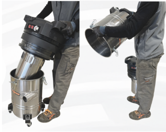
COLLECTION TANK Fast emptying