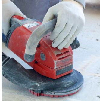
POWERTOOLS Powertool available